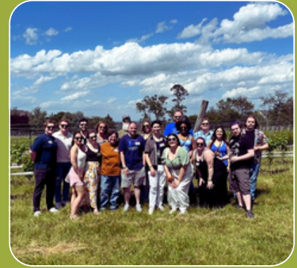
Good Spirit Farm Winery Offering award winning wines, this winery offers both high end tastings with a modern yet rustic space.