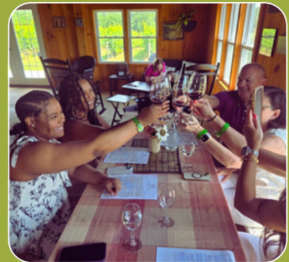
Carriage House Wineworks Family owned and produced wines in an enchanting tasting room surrounded by vineyards.