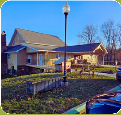
Casanel Vineyards & Winery One of Loudoun County's longest running wineries and perfect for group photos.