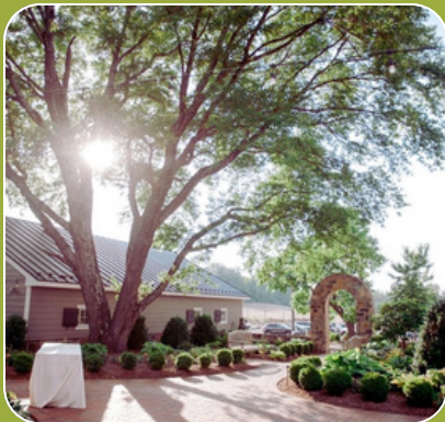
Fleetwood Farm Winery Beautiful wines from both Loudoun County and around the world with amazing lunch options.